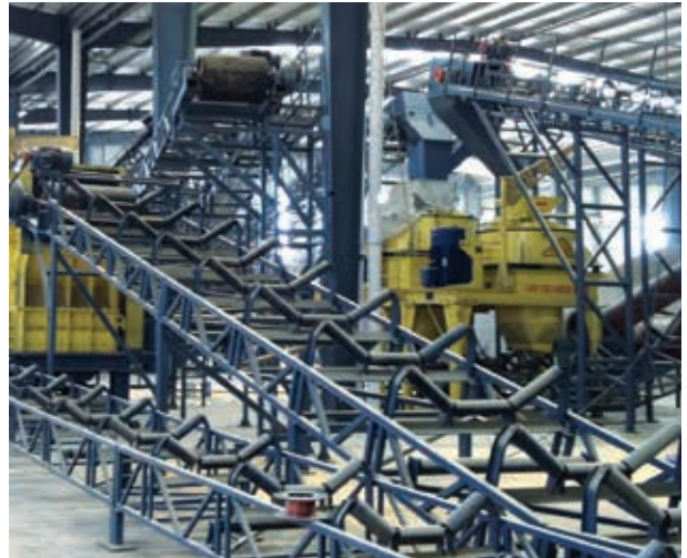
Ley Choon's newly set up construction waste recycling plant in Yantai Shandong China

asphalt plant in Singapore, and possibly in Southeast Asia. With the new plant, our production capacity increased more than three times from 175 tons per hour to 575 tons per hour which has resulted in higher revenue from the sales of asphalt premix, the details of which are discussed in the Operations Review. This is also the most modern recycling plant in Singapore which can recycle bitumen and aggregates up to 70%, far higher than the local standard of 30%.