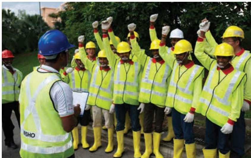
People – Ley Choon believes in giving proper supervision and training to get the best out of our workers

In the supervision over new employees, Ley Choon uses a mentor system, where the mentor provides guidance on the company’s initiatives, programmes, policies and procedures, and offers as a point of contact for questions and feedback.