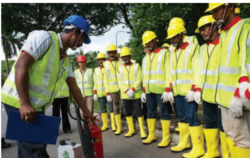
Safety training – Workers are familiarized with how to use fire extinguisher

All our businesses, except asphalt premix production and construction waste recycling, are mostly undertaken on a project basis and are non-recurring. Our