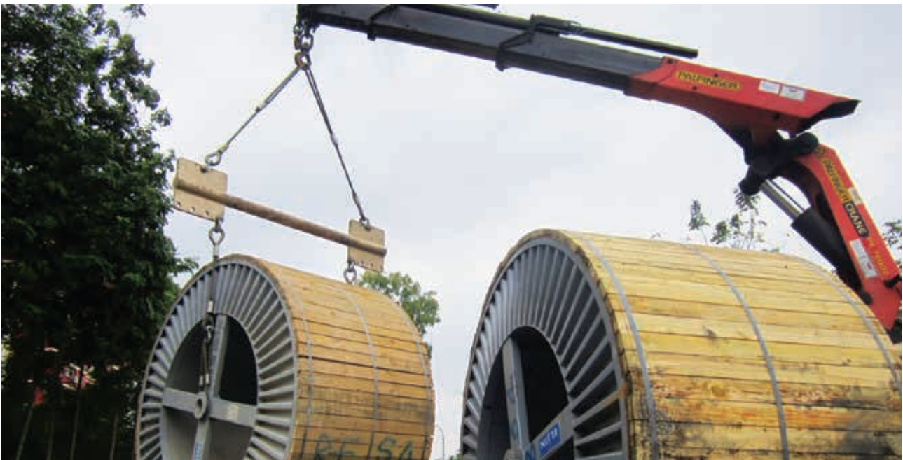
Worksite – laying of cable