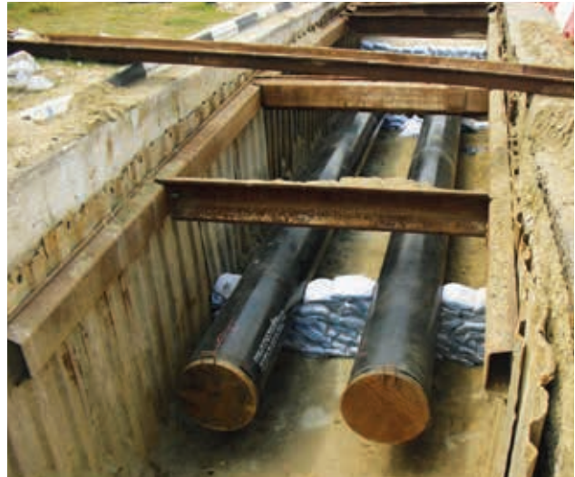
Worksite – laying of gas pipe

Some existing projects that we are involved in are the maintenance of expressway and roads and the laying of high-pressure had transmission pipeline works. In FY2014, the Group had also secured several projects, through its various subsidiaries, boosting its unfulfilled order book to S$188 million as at end February 2015. From the Public Utilities Board ("PUB"), the Group was awarded contracts involving the supply and laying of NEWater and industrial water mains, the supply and installation of water connection works, the supply and laying of watermains, watermain repairs and other contract work, and the maintenance and servicing of installations in water network in various locations in Singapore. From PowerGas Ltd, the Group was awarded contracts involving the laying of gas transmission pipelines in Woodlands and Choa Chu Kang areas. And from SP PowerGrid Ltd, the Group was awarded a contract for the installation of 66kV power cables, auxiliary cables and accessories.