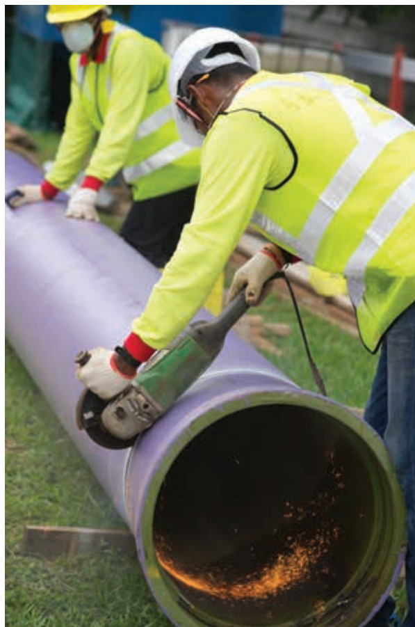
Safety – Workers are donned with proper safety gear at the worksites

Ley Choon reviews and monitors the project costs as best as possible and takes suitable action to control the costs of projects. At the same time, we also need to factor in an appropriate margin of safety for possible cost overrun.