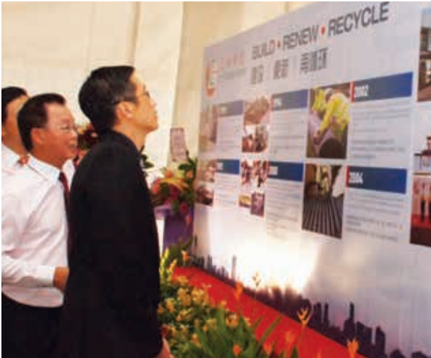
Mr Teo Ser Luck, Minister of State, Ministry of Trade and Industry and Mayor North East District officiated the opening of Ley Choon's Asphalt Recycling Plant on 19 September 2014