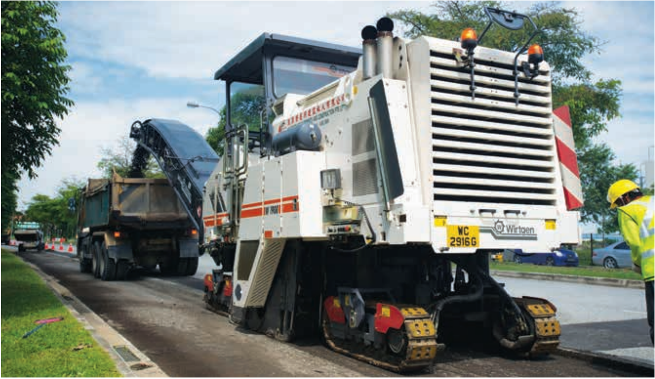
Worksite – road maintenance

The Group has been awarded a contract worth approximately S$38.2 million by the Ministry of Local Government and Provincial Councils Sri Lanka, which involves the rehabilitation of selected 10km of sewer lines and assessment of 125km of sewer lines within Colombo Municipal Council Area. This is the Group's first project in Sri Lanka.